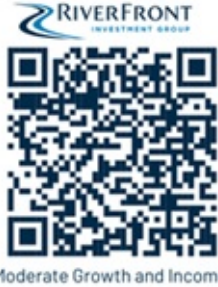
Moderate Growth and Income