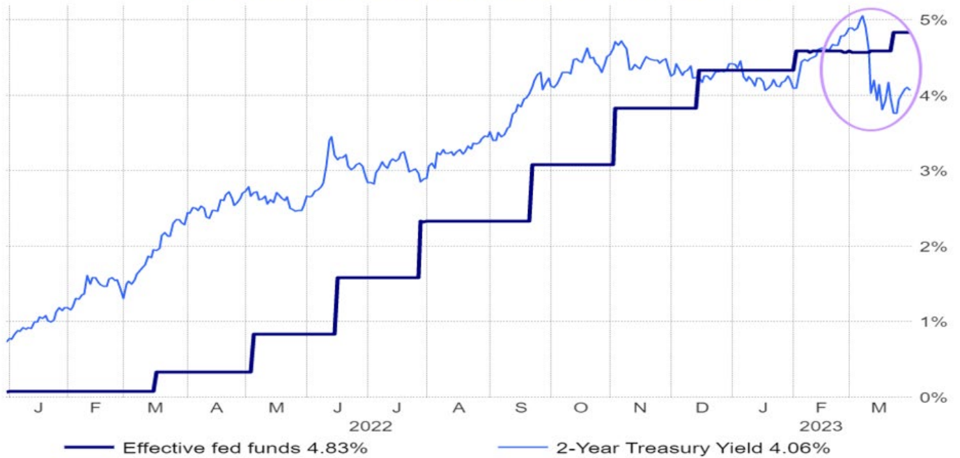
Source: Refinitiv Datastream, RiverFront; data daily, as of March 31, 2023. Chart shown for illustrative purposes. Not indicative of RiverFront portfolio performance.