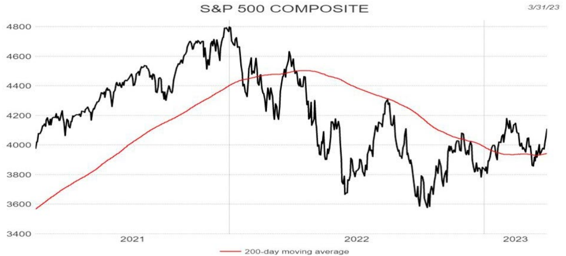
Chart shown for illustrative purposes. Not indicative of RiverFront portfolio performance.

The trend on the S&P 500 has been declining since January of 2022. However, the recent resilience of the index has caused it to trade in a narrow range, improving the primary trend, which we define as the 200-day moving average. Currently, the trend is falling at an annualized rate of -3%. If the current level on the S&P 500 of 4109 continues to hold over the next month, the trend could turn positive for the first time in