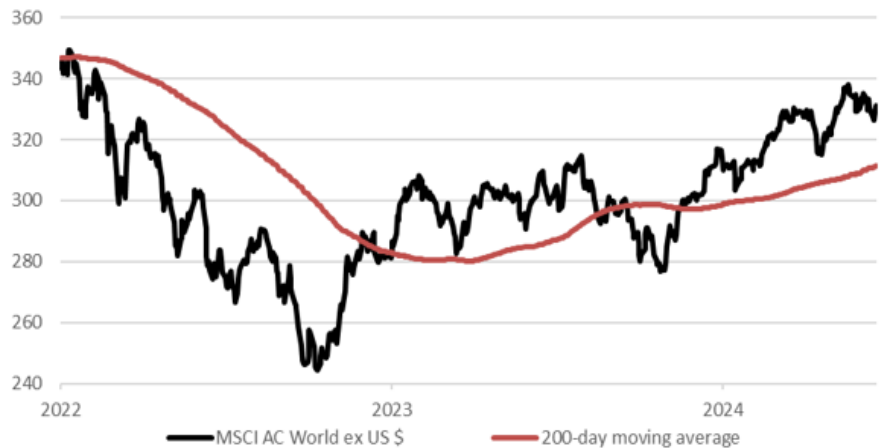
Data daily as of June 21, 2024. Chart shown for illustrative purposes. Not indicative of RiverFront portfolio performance. Index definitions are available in the disclosures.