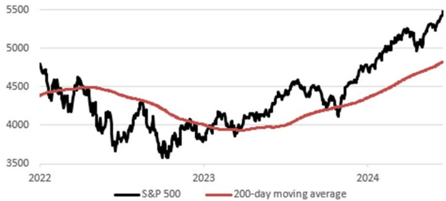
Data daily as of June 21, 2024. Chart shown for illustrative purposes. Not indicative of RiverFront portfolio performance. Index definitions are available in the disclosures.

Given the strength of the trend currently, as long as the S&P 500 remains above 5100, the trend will remain positive through year-end, in our view.